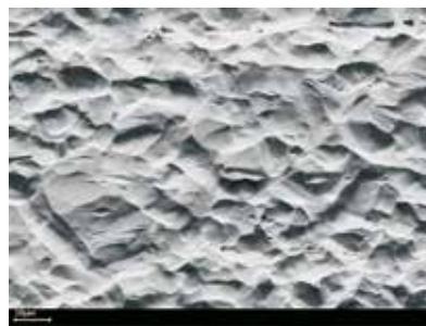
Standard quality tube annealed, chemically descaled, pickled roughness ID Ra approx. 2.5 µm

TPS-Technitube Röhrenwerke GmbH Julius-Saxler-Str. 7 · 54550 Daun/Germany Tel.: +49 65 92 71 20 · Fax: +49 65 92 1305 E-Mail: service@tpsd.de